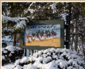
February may be chilly, but Pioneer is always "a warm place in the Son"