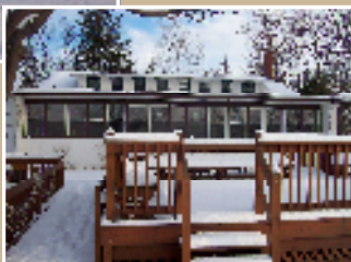
Hickman Hall—our main meeting hall