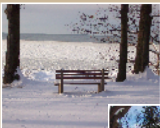
A beautiful winter view of Lake Erie!

More Information: www.NLOMA.org www.pioneercamp.org info@pioneercamp.org